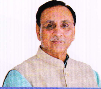
Shri Vijay Rupani Hon. Chief Minister, Gujarat