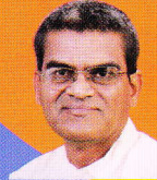
Shri Nanubhai Vanani Hon. Minister of State, Primary & Secondary Education