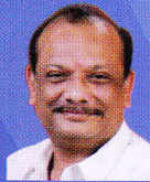
Shri Jaydrathsinh Parmar Hon. Minister of State, Higher & Technical Education