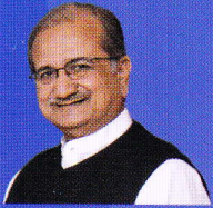
Shri Bhupendrasinh Chudasama Hon. Cabinet Minister, Gujarat Education (Primary, Secondary and Adult), Higher and Technical Education